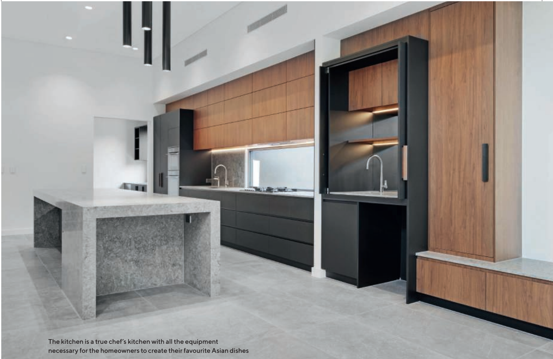
The kitchen is a true chef's kitchen with all the equipment necessary for the homeowners to create their favourite Asian dishes

A professional couple living in Jakarta with their daughter owned a block of land in the heart of New Farm, a trendy suburb in Brisbane, Queensland. The site had become run down and decrepit, so in a collaboration between O'Shea & Sons Builders, Merge Interior Design and Jazz Designs, a welcoming and functional space was created that brought together the essence of Queensland living with the clients' love of Indonesian culture.